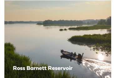
Ross Barnett Reservoir