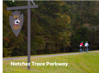
Natchez Trace Parkway

Explore Ridgeland, where travelers have near endless opportunities to discover their passions. Nestled along the historic Natchez Trace Parkway, Ridgeland offers a unique blend of outdoor adventures and urban luxuries, from scenic trails, crafts, fine dining, premier shopping, and events.